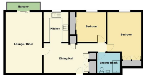
Flat 14, Clifton Court, 297, Clifton Drive South, Lytham St Annes, FY8 1HN

Total Area: 89.7 m 2 ... 965 ft 2 (excluding balcony)